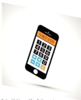
Ready to Retire Webinar – After Retirement